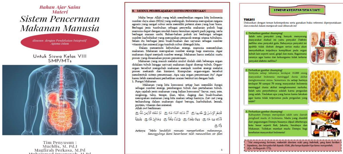
Figure 1. Human Digestive System Teaching Materials

In this study, student's worksheet is designed to contain various health problems of human digestive organs in real life with the hope that students can carry out scientific activities such as observations, investigations, experiments and students are expected to be able to provide solutions to various digestive organ health problems that arise in the community. In student's worksheet, there are higher order thinking skills (HOTS) questions that are adjusted to the conditions of junior high school's students. Scientific activities in the 2013 curriculum are set out in a scientific approach which has stages, namely observing, asking, exploring, associating and communicating. This scientific approach with the attribute "doing science". This approach facilitates the learning process to be more meaningful and detailed (Arini, 2020).